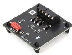
Option LEM 101