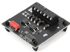
Option ASM 101