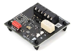
Option WRM 101